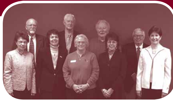
2006 Board Members and Trustees (L-R):

The MACF accepts gifts, participates in grantmaking, and provides community leadership within the greater Jackson County area. The MACF is governed by a seven member board of directors with two trustees.